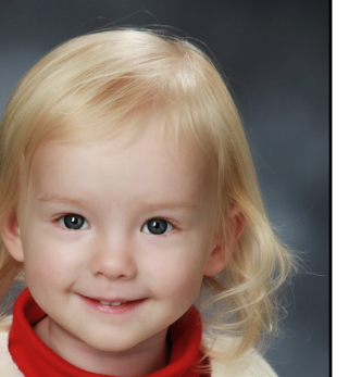
Please Circle the Package #s & A La Carte Products you wish to order from Pose A