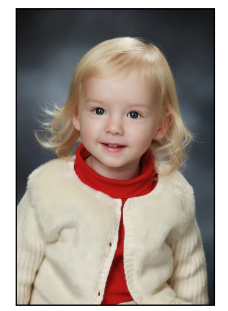
Please Circle the Package #s & A La Carte Products you wish to order from Pose B